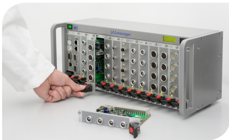
Easy „on-the-fly“ change of the slide-in modules

LabManagers® can be modified or upgraded by the user at any time and thus be adapted to the changed or increased tasks. The scalable system grows with the demands placed on it from a small data logging system up to a complex process control system. In this way your process is able to migrate from the laboratory into a pilot plant, into a mini plant and into production. At an early stage you are able to gain important knowledge on the capability of your process to be automated and can thus shorten the time to market.