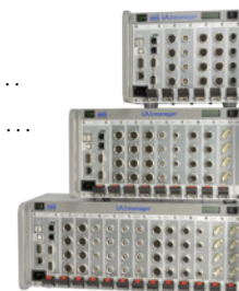
LabManager® 1 to 3