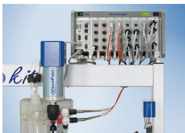
LabManager® can be installed space-saving on a construction

LabKit™ makes use of the capabilities of the HiTec Zang LabManager® system. It offers simple programming and operation, universal interfaces with distinctive plug connectors and excellent robustness. LabManager® systems can be operated in fume cupboards.