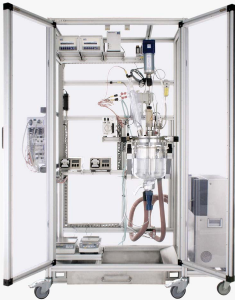
Laboratory calorimeter with a 5-litre glass reactor with a stainless steel lid, heat balance calorimetry and extensive sensors