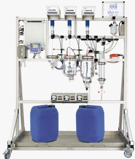
Laboratory clarification unit with pH, turbidity and foam sensors, stirred tanks in continuous operation