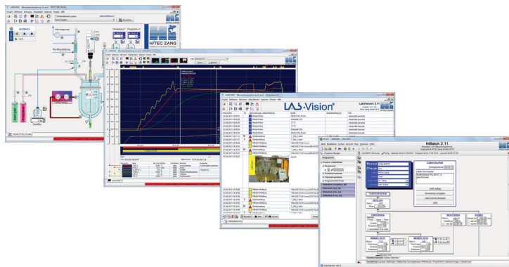
Research process control system LabVision®

You, as a user, can connect new sensors and actuators yourself without any problems. Many types of interface are available as a ready-to-use module, others can be easily defined and calibrated by yourself. An extensive library of devices connected in series, such as thermostats, pumps, scales etc., is also supplied. An editor simplifies the setting up of NAMUR compliant communication protocols.